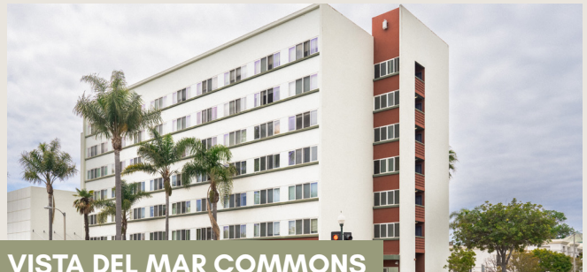
VISTA DEL MAR COMMONS